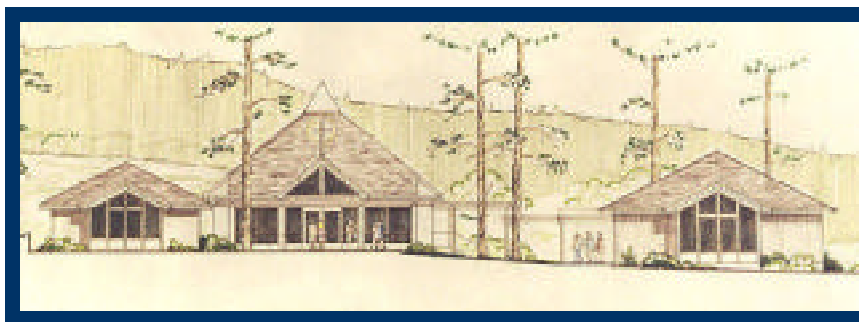
Living Hope Church in Monterey - from drawing...