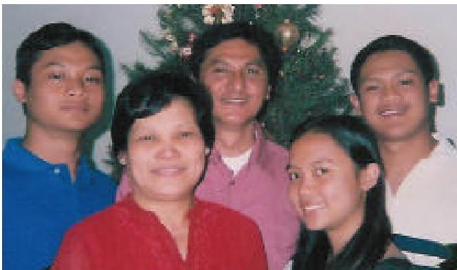
The Laroyas Family

CORRECTION!! Please note that the starting times for all evening District Assembly activities is 7:30 pm. Sorry for the confusion. -Robin